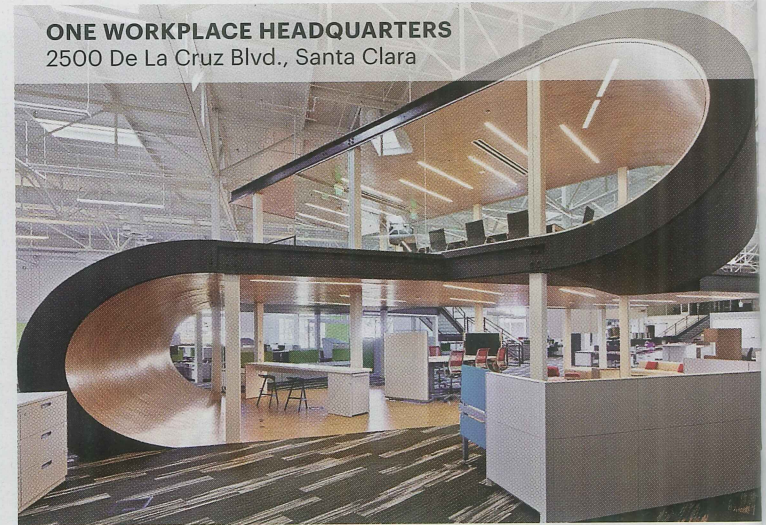
ONE WORKPLACE HEADQUARTERS 2500 De La Cruz Blvd., Santa Clara

"Some elements we kept and incorporated into the new design ... It's unique and different."